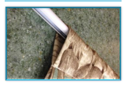
<u>Step 1</u>: lay your treatment down with the back facing you. Locate the pocket that has been made for your rod at the top of the curtain.

<u>Step 2</u>: Slide your rod into the pocket provided on the curtain.