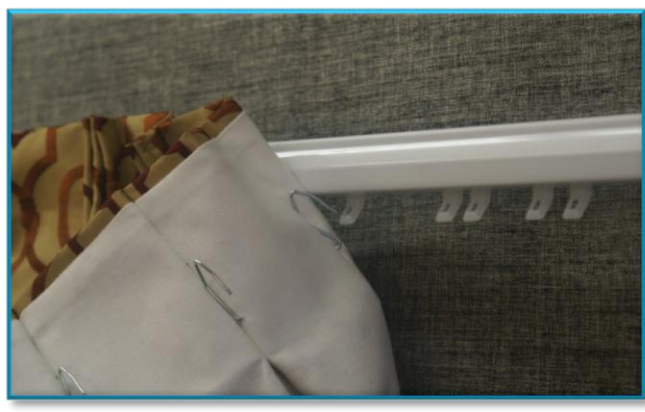
<u>Step 3</u>: A Stiffener, called a crinoline/buckram, is sewn into the pleats at the top of the treatment. You will need to crease/fold the stiffener between each pleat vertically.

Step 2: Insert pins through the eyelets of the rings or carriers.